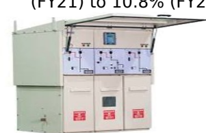
RMU Ring Main Unit